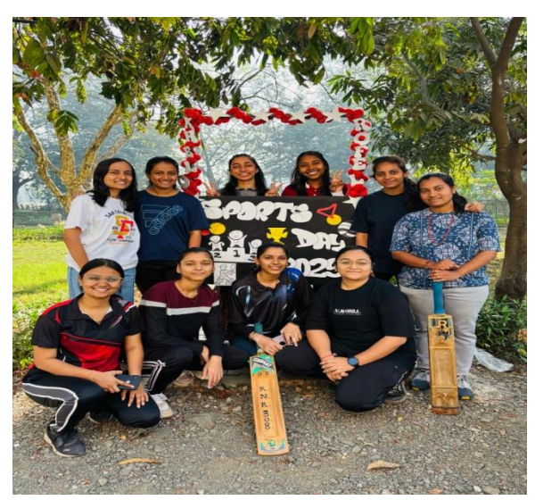
Participants enjoying sports and selfie point during Alumni meet cum sport day-2025

Whether alumni participated as a player, a supporter, or simply enjoyed the atmosphere, their presence made this event meaningful. Let's carry the spirit of camaraderie and teamwork forward, and continue to stay connected as a vibrant alumni community of ROFEL Shri G.M. Bilakhia College of Pharmacy. Thank you all our dear alumni for making today a success, and we look forward to seeing you at future gatherings!