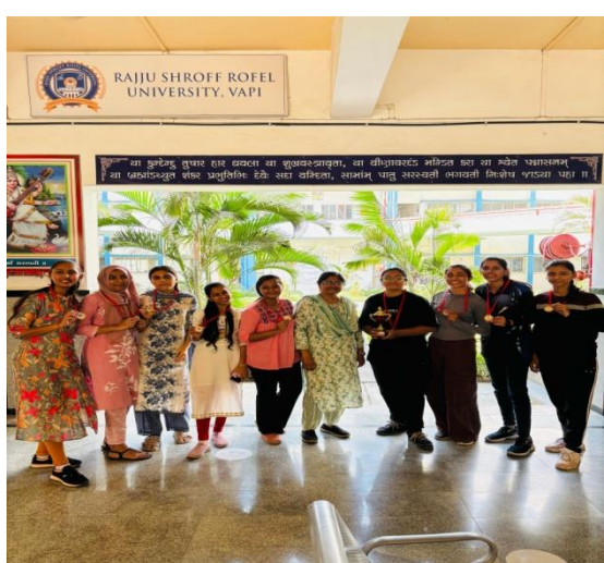
Winners of cricket match Boys and Girls Alumni meet cum sport day-2025